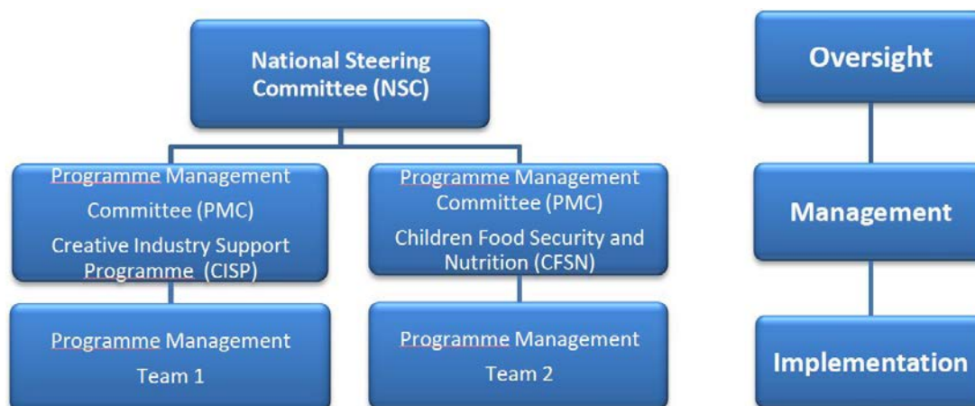
Figure 3: MDG-F Joint Programmes Governance and Management set-up