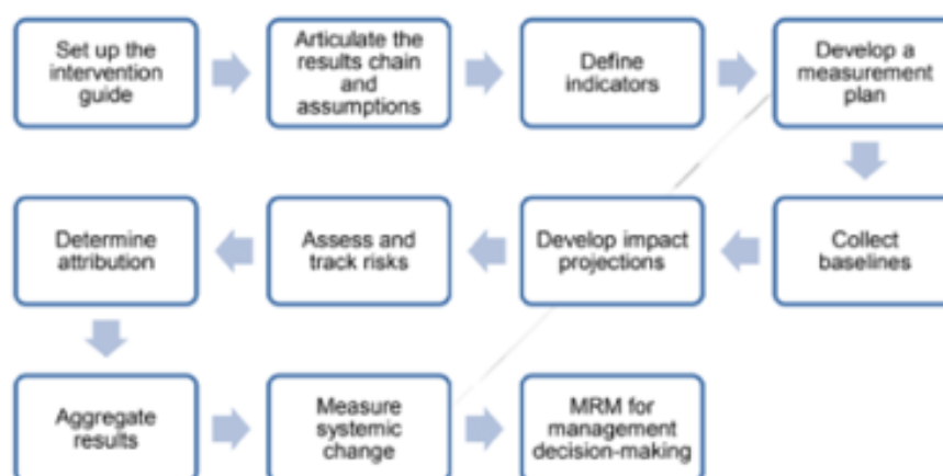
Figure 1: R2J's MRM process 47

Beyond monitoring and results measurement, the project has worked in close collaboration with The Lab , a global initiative funded by the Swiss State Secretariat for Economic Affairs (SECO) and implemented by the ILO to generate and apply knowledge on MSD for decent work. 46 It promotes a systemic lens to value chain development and encourages the use of the DCED Standard for Results Measurement. It has supported R2J through technical assistance and guidance on market systems and has co-invested in research opportunities. The project's collaboration with the Lab has enabled the creation and publication of numerous knowledge products, centralising evidence on the project's outcomes and providing lessons to adjust its design and implementation accordingly.