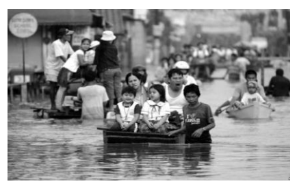
A Filipino family copes with the floods brought by Typhoon Pepeng in 2009

The Philippine Government has adopted important policy measures and strategies to address the challenges brought about by climate change. The Climate Change Law , enacted in October 2009, is the main policy response of the GPH. It mandated the creation of an inter-agency body [i.e. the Climate Change Commission (CCC)] to primarily mainstream climate change concerns into government plans and actions and serve as a coordinating mechanism among the various government agencies on climate change activities. The law further directed the development of a National Framework Strategy on Climate Change and a National Climate Change Action Plan , which were subsequently approved by the GPH in April 2010 and November 2011, respectively.