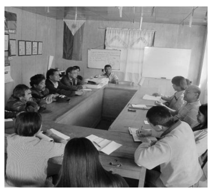
Other mechanisms, such as this Local Working Group in Benguet, helped develop community ownership over the programme

Project-level versions of the PMC were organized in the demonstration sites, and these could have been positive factors in building a sense of ownership at those levels. These mechanisms carried different names (i.e.