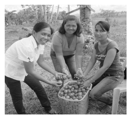
Income increments were reported by womenbeneficiaries of the Innovative Financing Scheme in Agusan del Norte

Several farmers who benefited from the lending programs reported positive effects in terms of increased incomes from their main crops and the additional produce (e.g. vegetables) brought about by the programme. They attributed their additional incomes to lower costs of financing (offered by the program) and good prices during harvest time. The income increments derived by the beneficiaries from the intervention were assessed by them to be significant for their needs (i.e. around US$ 200 – US$ 300 per hectare). Aside from their monetary gains from the pay-outs, beneficiaries of the insurance scheme also positively noted the simplicity and promptness of the pay-out system. Women were visibly present in these schemes: around 60% of the beneficiaries in the financing and insurance systems were women.