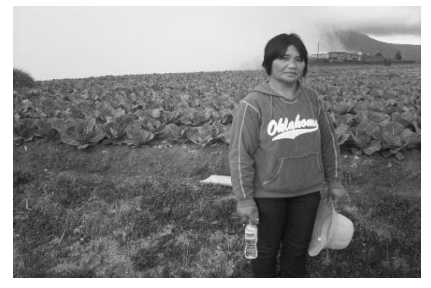
Women-farmers actively participated in the testing of the CCA Options in Benguet and Ifugao

On the other end, farmers who benefited from the small water impounding and rehabilitated irrigation systems noted steady access to water supply, particularly in the context of changed rainfall patterns, as the primary beneficial effect of the project to their households and communities. Women-farmers also turned out to be active participants in the project in Benguet and Ifugao: around 245 out of the 519 farmers (47%) who participated in the testing of the CCA Options were women, who were likewise vocal about the concept of climate change and its specific effects on their communities.