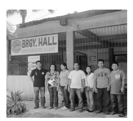
Community Officials participated in the modification of their Barangay Contingency Plan

The creation of the Climate Change Academy was also reported as a project output. The Climate Change Academy is envisioned by the Provincial Government of Albay to become a formal learning institution