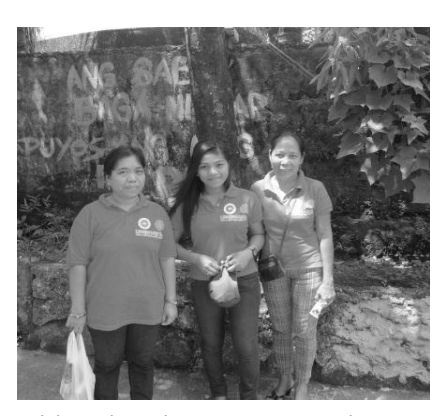
While unplanned, women participated significantly in the project activities in Sorsogon City and in most other areas

The report had earlier pointed out the significant role of women in the programme, particularly in Outcome 3 where women-farmers participated in the piloting of the CCA Options in Benguet and Ifugao, and in the test runs of the Innovative Financing Scheme and WIBI in Agusan del Norte. In Sorsogon City, women were also key participants in the retrofitting scheme and in the conduct of the alternative livelihood training courses. In general however, the strong participation by women in the programme happened by chance and not by any proactive strategy adopted by the programme on gender equality. When asked why they were the ones who were participating in the projects and not their spouses, the women simply said that it was because they were the ones who had the time to attend the project meetings and other activities. Still, it appeared from the discussions with the women-beneficiaries that farming decisions over climate change-related issues (e.g. which varieties