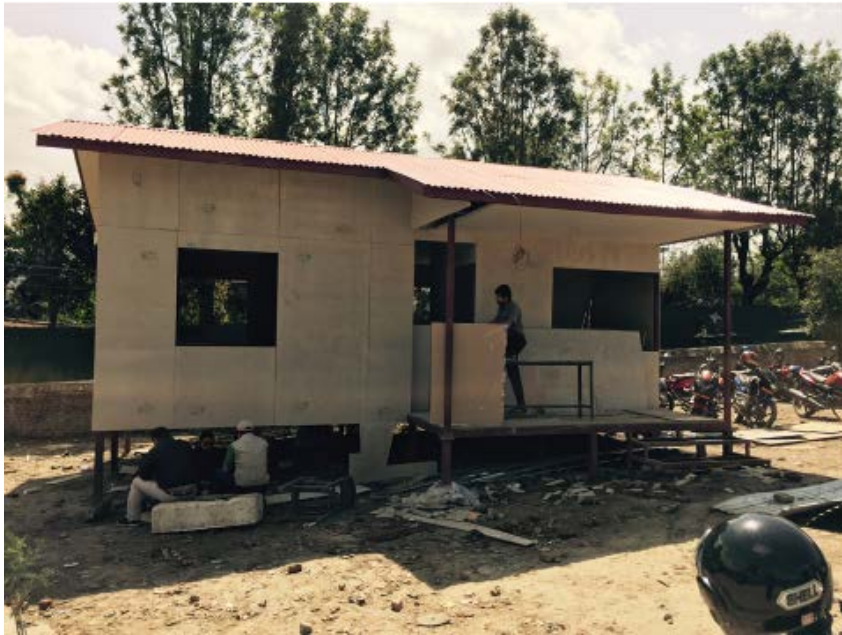
Photo 1: Migrant Resource Centre under Construction in the Labour Village, Kathmandu